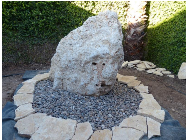
What a difference a day makes!