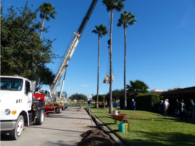
Mobile Crane Service lifting the rock from the truck.

On November 30 th , 2016, we witnessed the setting of the fountain rock at “The Vannie E. Cook Jr. CHILDREN’S CANCER and HEMATOLOGY CLINIC”. This South Texas Border Chapter Texas Master Naturalist project to design and implement a native plant Bird and Butterfly Garden at the clinic was accomplished with excellence. The STBCTMN crew assisted by outside contractors who donated their time and resources made significant strides forward on panning, improving and beautifying the new garden area