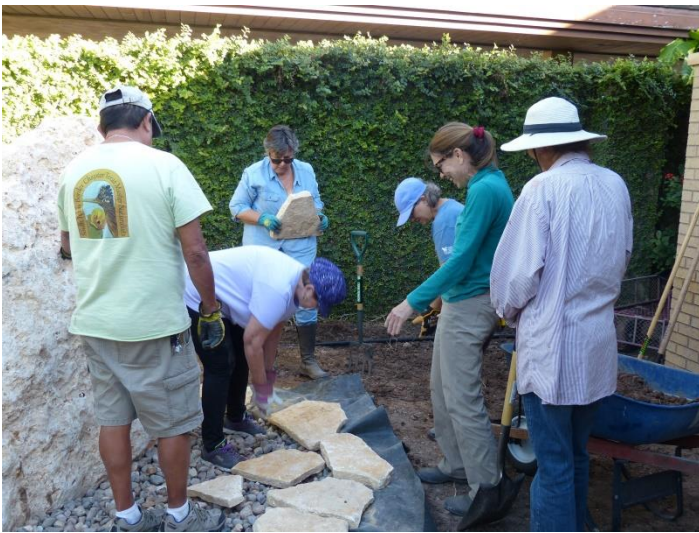
Let's get these set!