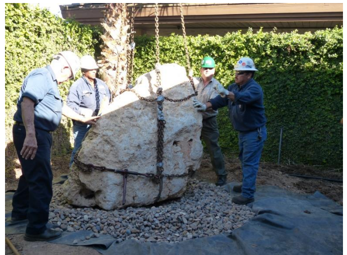
Just about right!