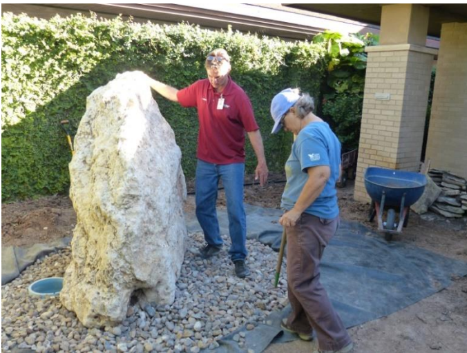
Here's what needs to be done!