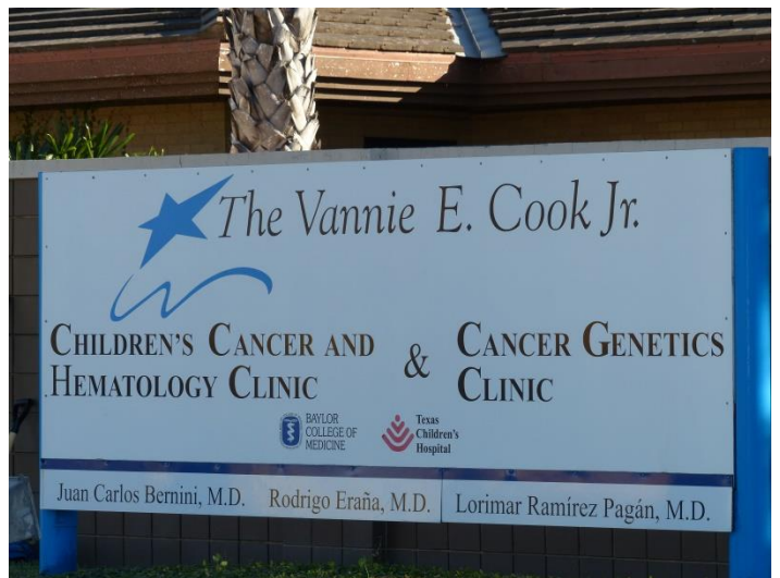
A WORTHWHILE CAUSE!