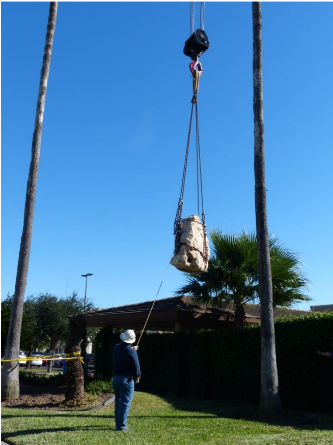
Moving the rock to lower it over the garden wall.