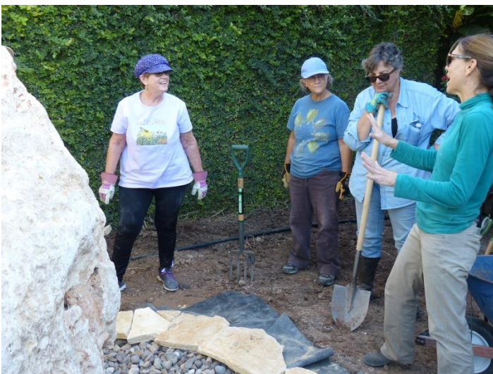
Looking Good and Almost Done!